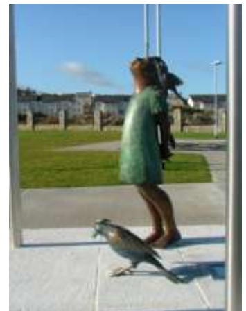
An Saothar Ealaíne ‘Clóna’ ag Taobh na Coille

We have noted that parents are allowing their children to climb on our beautiful statue ‘Clóna at Taobh na Coille’ as they come and go from the school. This is a work of Art and not a climbing frame. We would ask parents to stop their children/toddlers from climbing up onto the base of the statue. Children attending the naíonra & some children in the infant classes are the biggest culprits here.