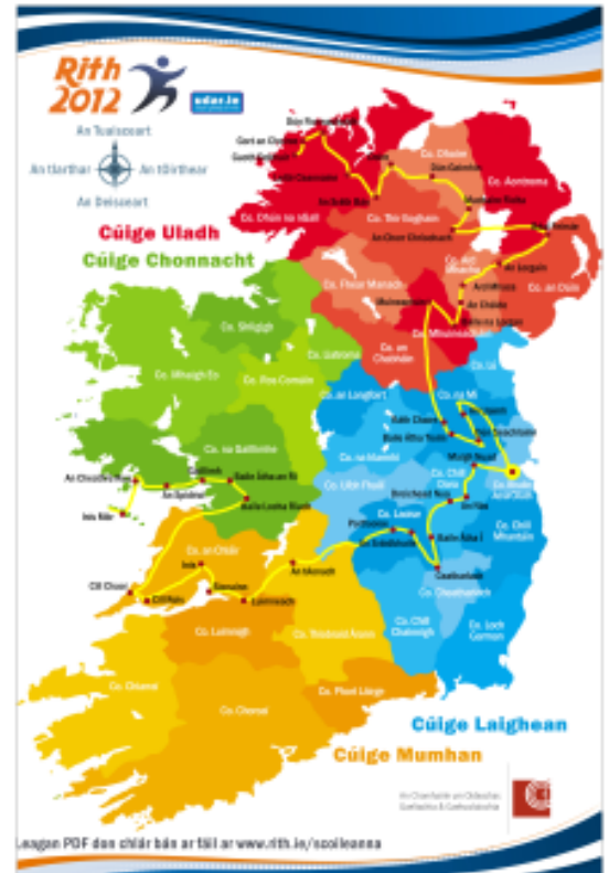
Cúrsa RITH 2012

Tá fáilte roimh thuismitheoirí rith linn. Tar amach agus glac páirt sa spórt is spraoi! Tar amach agus bíg linn!